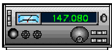
LC Echo Repeater 100 HZ PL

Gregg Crump, N8GEO 29729 South River Harrison Twp., MI 48045 (586) 477-0364 n8geo@arrl.net